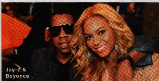
Jay-Z & Beyoncé

8 THE NUMBER OF WEEKS JAY-Z AND BEYONCÉ'S HYPNOTIC JAM "CRAZY IN LOVE" TOPPED THE U.S. CHARTS IN 2003.